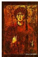
Icon of St. George